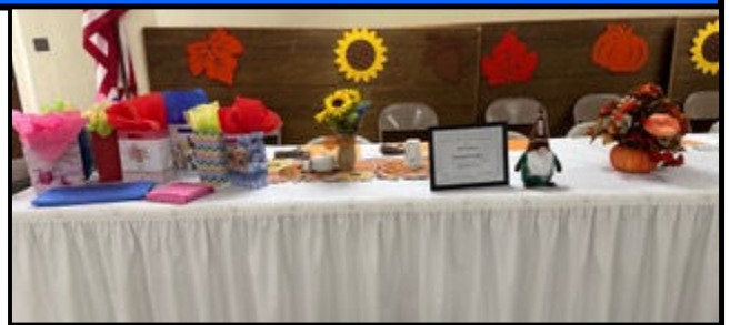
Head table showing off the silver certificate at the September luncheon .

Hancock County Retirees celebrated WVARSE Week with a luncheon. They proudly displayed the Silver Certificate they were awarded at the WVARSE Annual Conference. They pledge to work harder and earn a Gold Certificate next year.