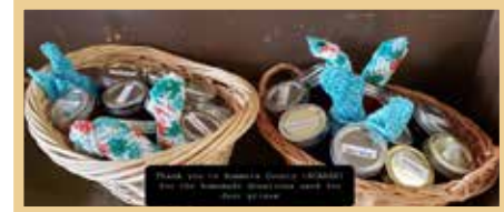
Special thanks to Summers County who for donated gift baskets for a drawing at the end of the meeting