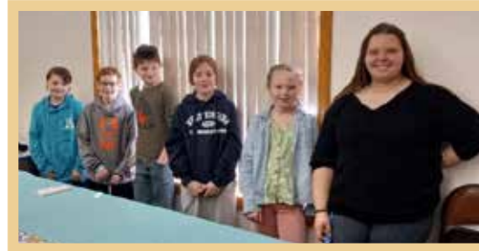
Gilmer County Elementary School Science & Social Studies winners presented their projects to the retirees.