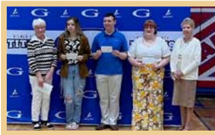
The GCARSE scholarship winners