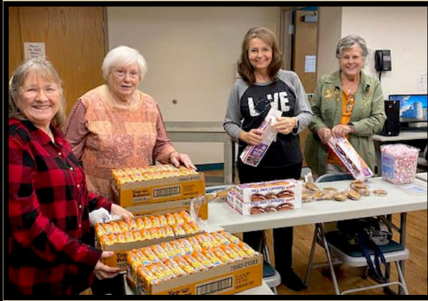
Members assembling Blizzard Bags for Meals On Wheels of Lewis County

At their October meeting members of the Lewis County Chapter of WVARSE packed blizzard bags with non-perishable food for Meals On Wheels recipients in their local area. Members assembled 90 bags containing breakfast, lunch and snack items along with handwritten cards. The bags were decorated with winter scenes by Jane Lew Elementary School art students.